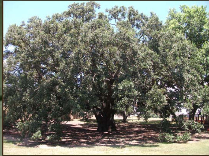
Freedom Oak – Misty Hollow Drive – Lake Olympia Missouri City's Oldest Living Resident

The City Forester will help you determine an appropriate species and location for your memorial tree.